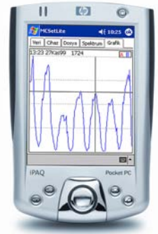
MCSetLite running on a Pocket PC with Turkish language settings.

Traffic Executive's MCSetLite module for the Pocket PC now has full language support. All menus and dialogs can appear in a variety of languages. All field survey operations, including installing, starting and monitoring your MetroCount 5600 Series Roadside Units can be performed by field staff in any convenient language!